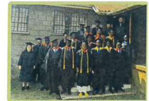
Nairobi Baptist Bible College: Class of 2025 Graduates and Faculty